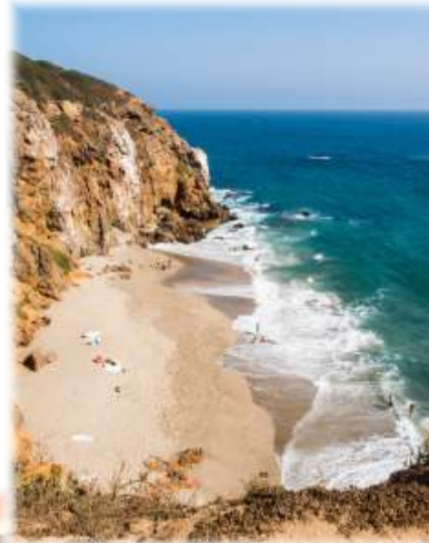
Escondido Falls, Point Dume State Beach, and El Matador State Beach within 20 miles.