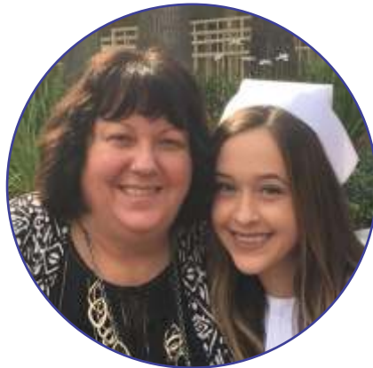
Staff of R.N Instructors