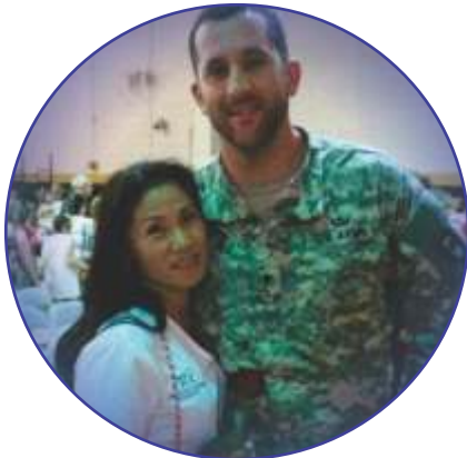
VA/ GI Loans & Scholarships