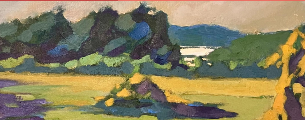
Frank Federico, Untitled , Oil

* NOTE: Please register artwork online and view our exhibition policies prior to artwork drop-off. Registration paperwork can be found by visiting the link below: