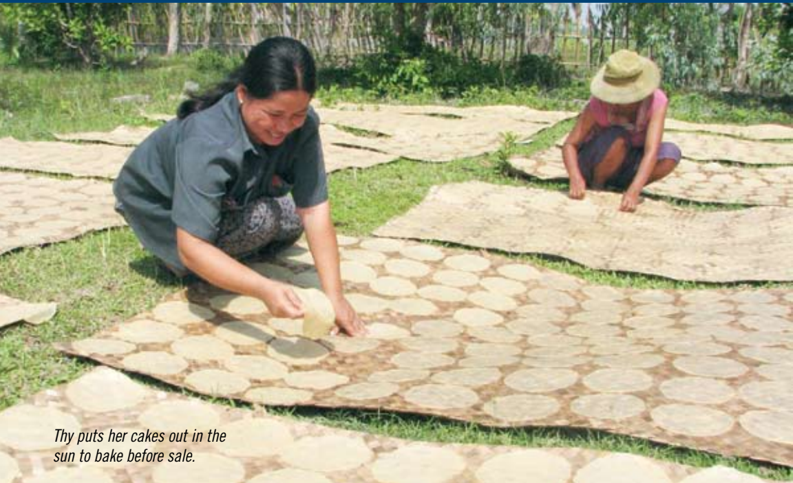
Thy puts her cakes out in the sun to bake before sale.