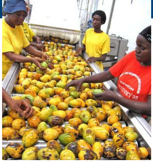
Employees of Africa Felix Juice process the mangos supplied by Outgrower farmers.

Some teething problems were experienced during this first season. Over the project's duration, Outgrower farmers harvested, packaged and sold more than 12,900 crates of mangos—a total weight of approximately 500,000 pounds—to AFJ. The fruit generated approximately $11,650 U.S. in revenue for the farmers. A majority of these mangos would have rotted due to lack of demand, but instead, these farmers and their community benefited from the naturally available resource. They gained experience working together as a community, thereby building social trust and paving the way for prospective projects and greater economic development in the region.