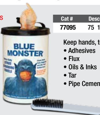
Free Hand & Nail Brush included in each container!

BLUE MONSTER scrubbing towels are pre-moistened, heavy-duty cleaning towels dispensed from a handy, flip-top container. They are saturated with a safe, effective cleaning solution combined with a tough, dual-textured towel to loosen, dissolve and absorb dirt and grease leaving your hands clean. One side is rough for scrubbing and the other side is smooth. These towels require no water and leave hands feeling conditioned and clean with no left-over residue.