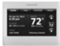
THX9421R5021WW or THX9421R5021WG