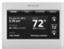
THX9421R5021WW or THX9421R5021WG