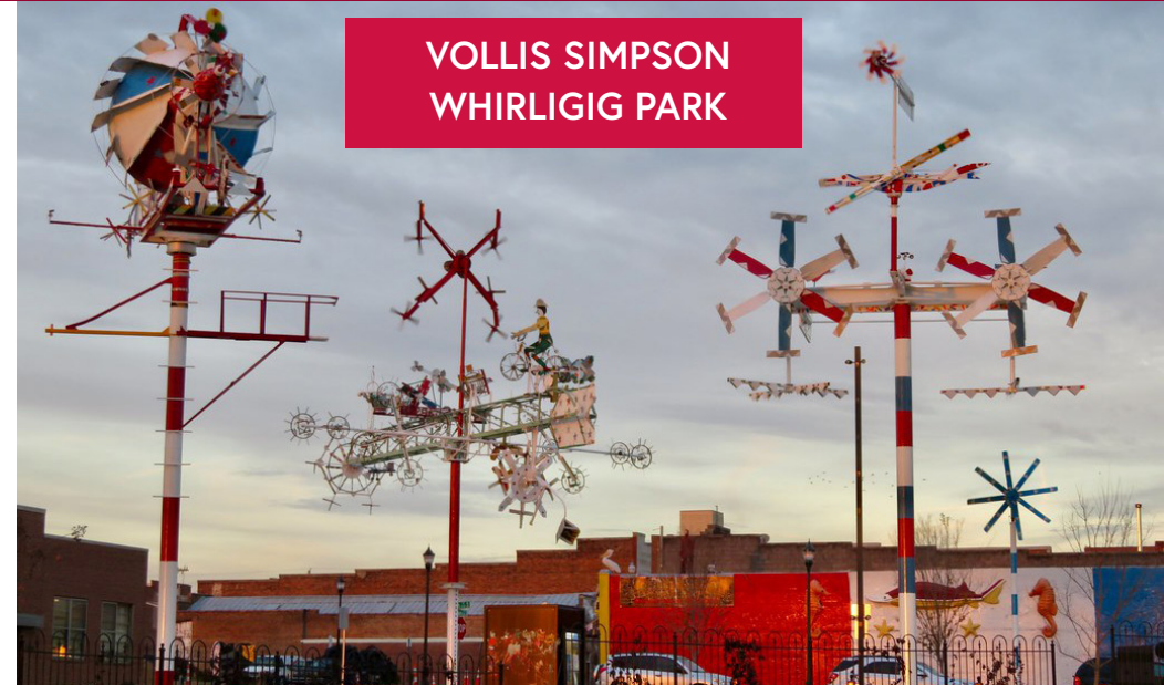
VOLLIS SIMPSON WHIRLIGIG PARK

One of the biggest attractions is the Vollis Simpson Whirligig Park located in Downtown Wilson. The 2-acre park showcases the gigantic kinetic sculpture created by the late Mr. Vollis Simpson, a native of Wilson. His sculptures are on display at the American Visionary Art Museum in Baltimore and the American Folk Art Museum in Manhattan.