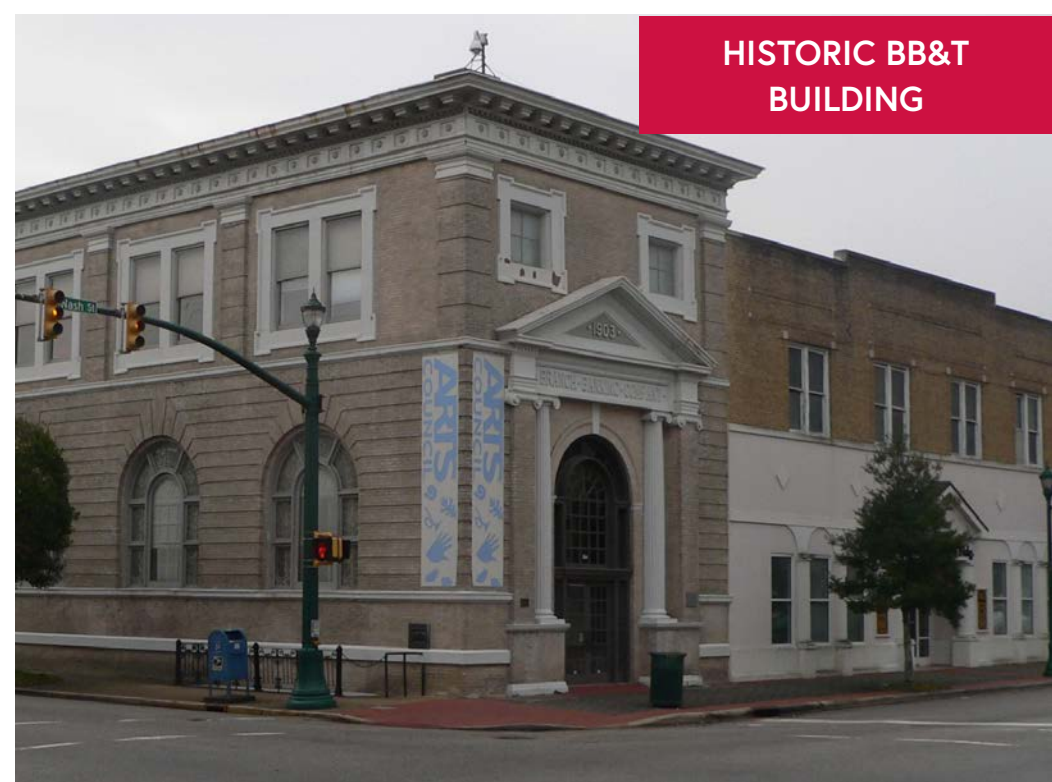
HISTORIC BB&T BUILDING