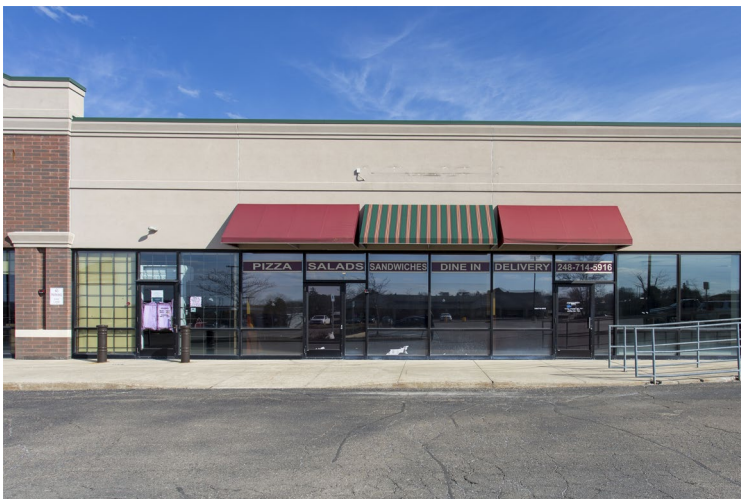
AVAILABLE SHOP STOREFRONTS