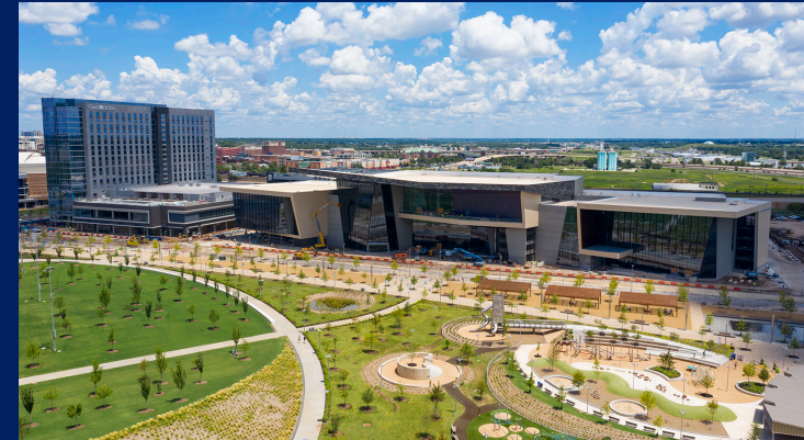
The new 605 room Omni hotel, convention center, & Scissortail Park are all nearby