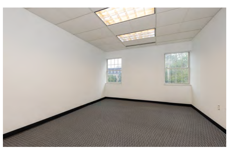
24600 Center Ridge Rd.