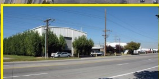
1874 PIONEER ROAD

70,000 SQ. FT. WAREHOUSE/MANUFACTURING FOR SALE