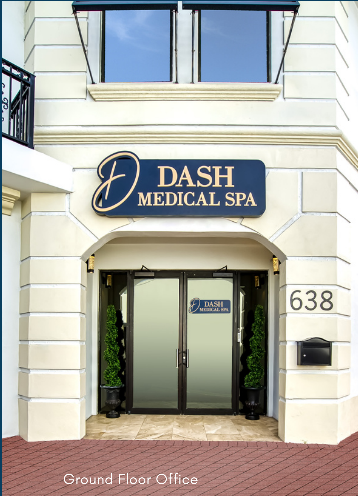
Ground Floor Office

630-638 East Atlantic Ave., Delray Beach, FL 33483