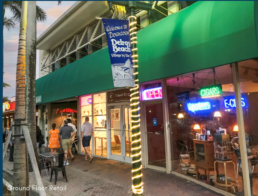
Ground Floor Retail