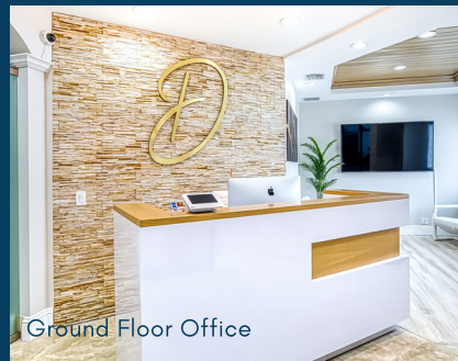
Ground Floor Office