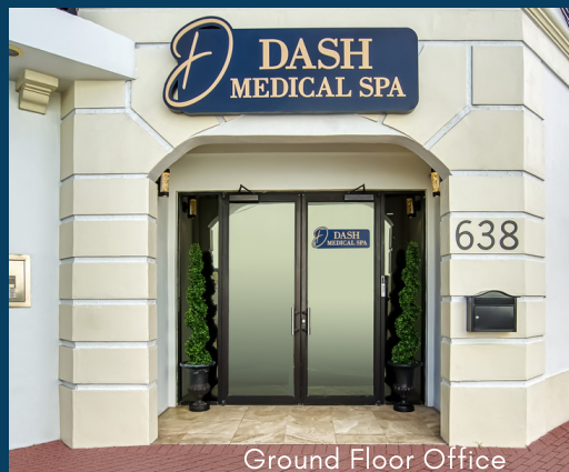
Ground Floor Office