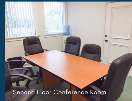
Second Floor Conference Room