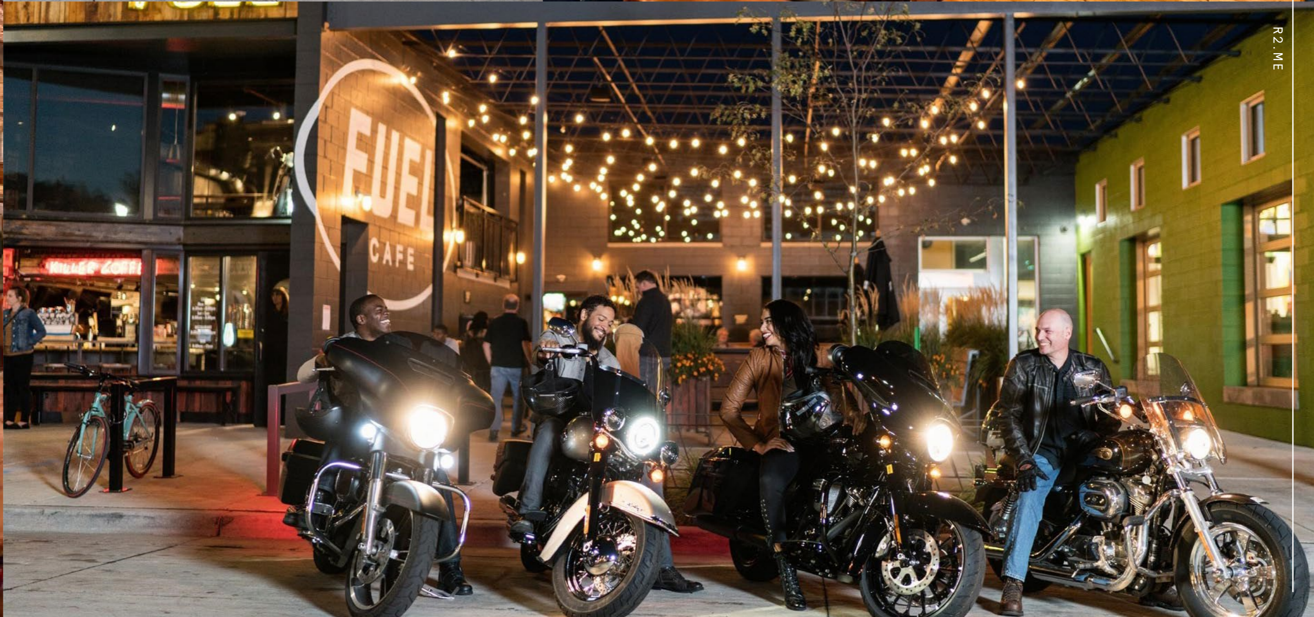
— WALKER'S POINT Location/Neighborhood