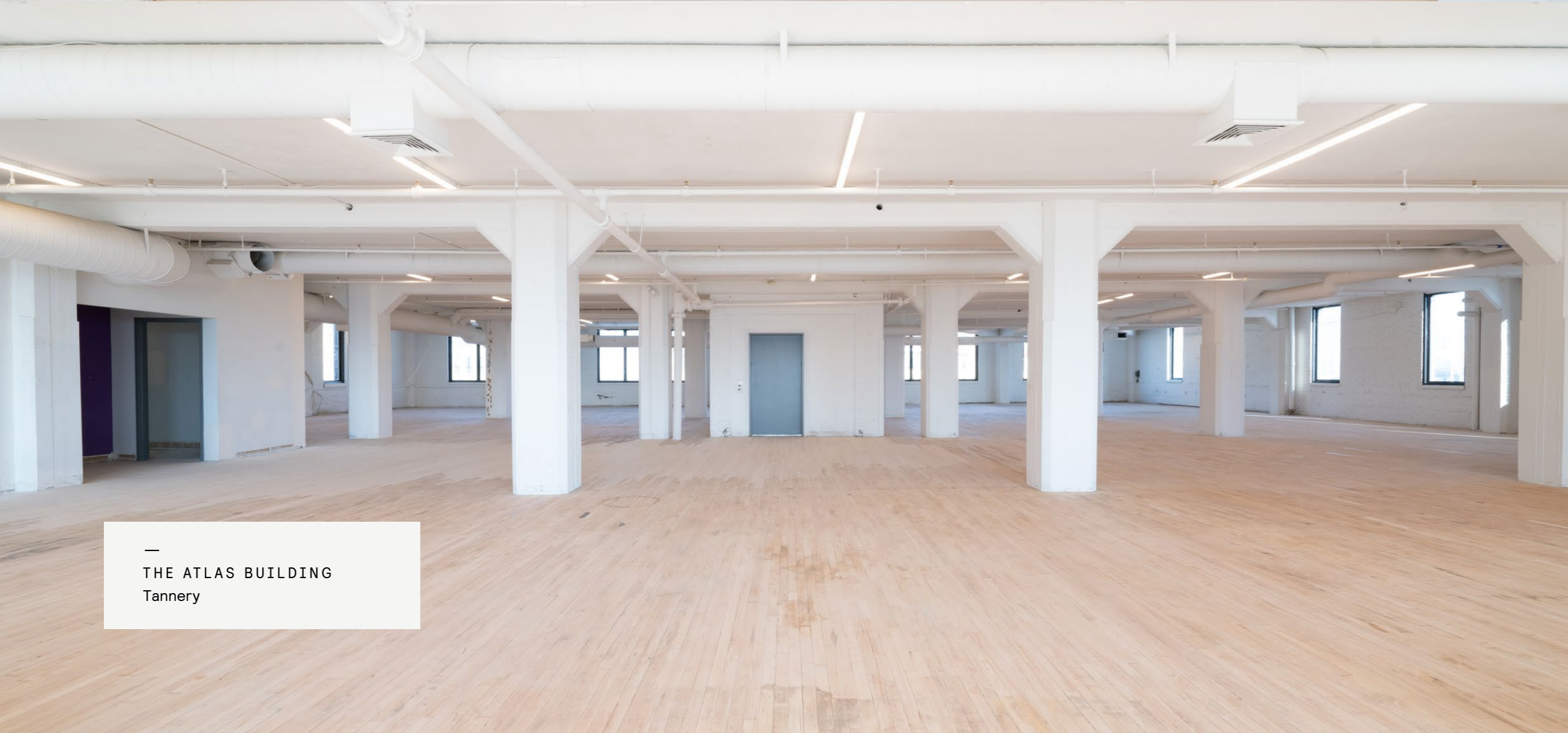
— THE ATLAS BUILDING Tannery