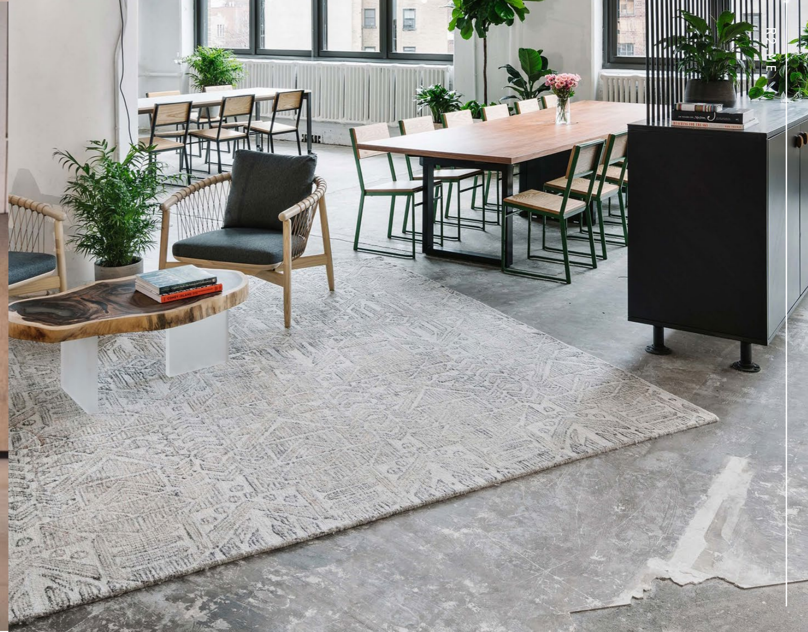
— INTERIOR PRECEDENTS The Atlas Building