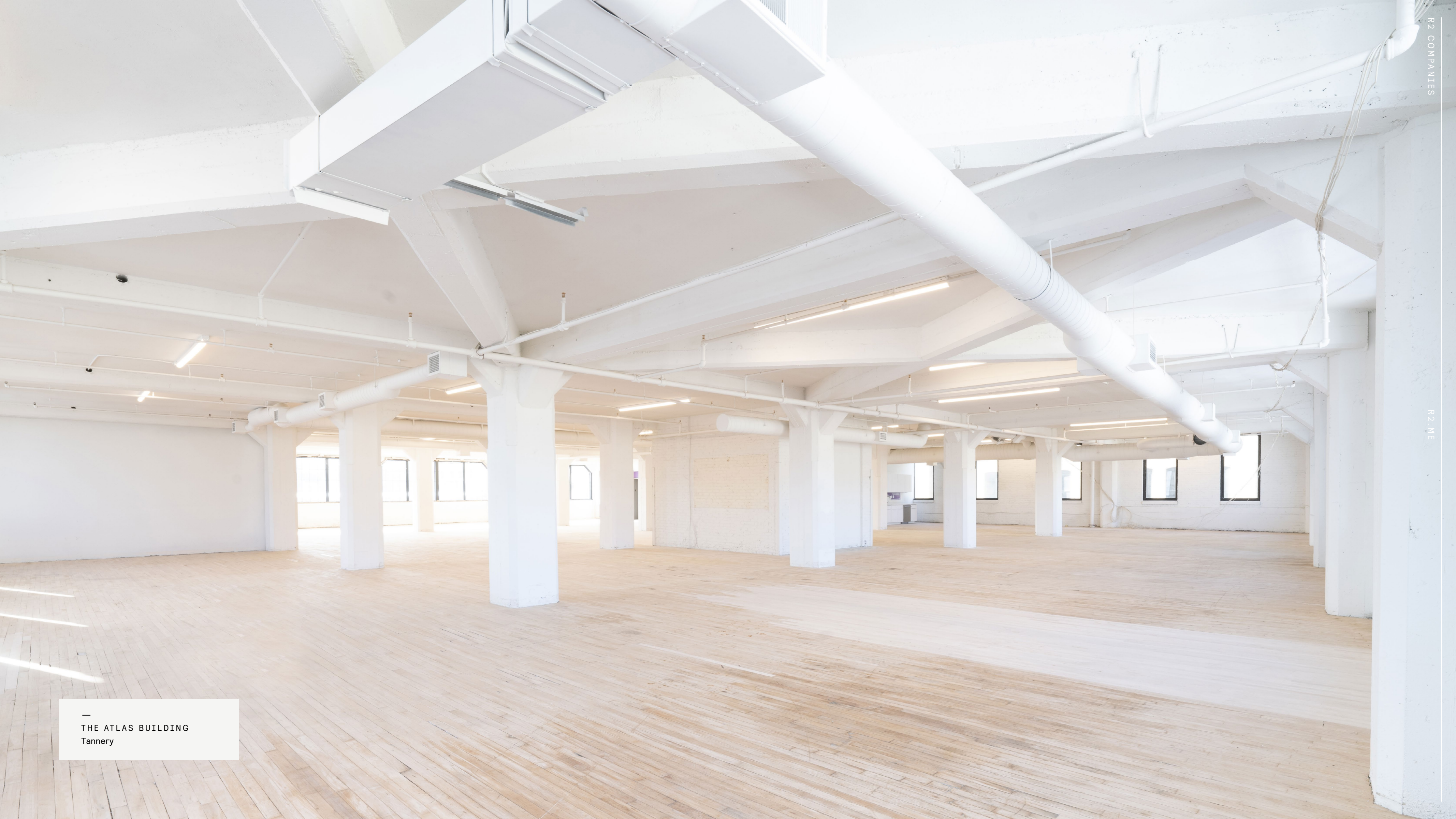
— THE ATLAS BUILDING Tannery