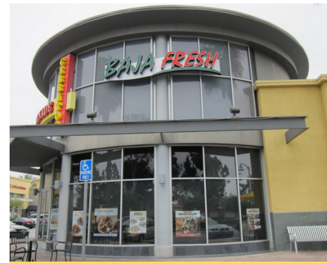
Bldg A | A-8 | 2,758 SF Prominent endcap restaurant unit with ideal location and visibility within the center