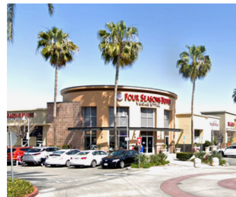
Bldg B | 10,436 SF Prime anchor space; most prominent in the center; former restaurant