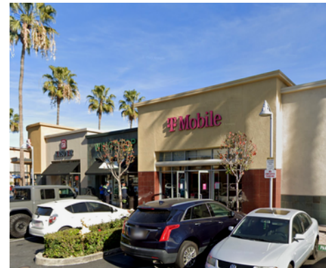
Bldg A | A-7 | 2,745 SF In-line unit close to shopping center entrance