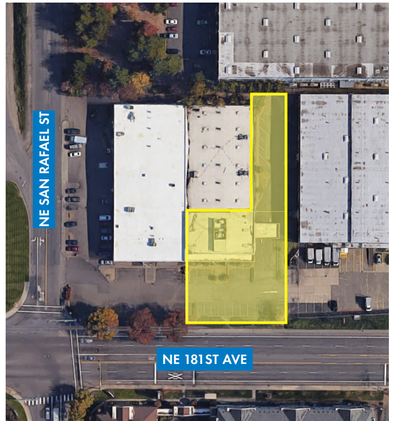
Property on the southside of the building with access from NE San Rafael Street.