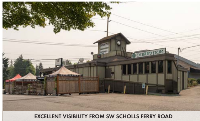
EXCELLENT VISIBILITY FROM SW SCHOLLS FERRY ROAD