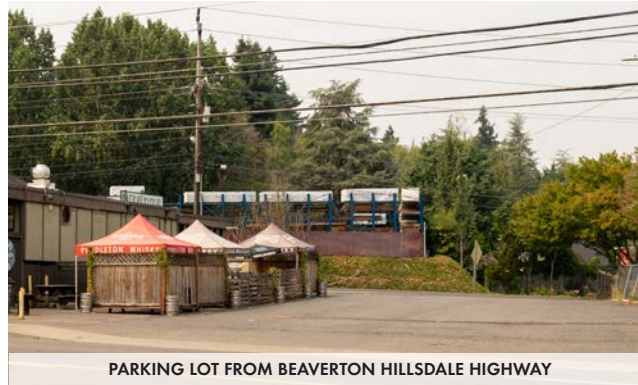
PARKING LOT FROM BEAVERTON HILLSDALE HIGHWAY