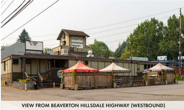
VIEW FROM BEAVERTON HILLSDALE HIGHWAY (WESTBOUND)