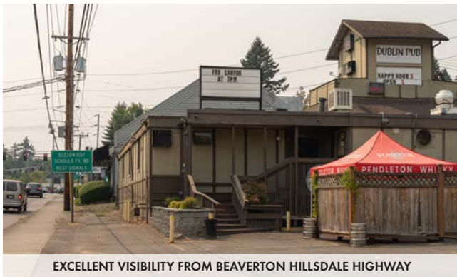
EXCELLENT VISIBILITY FROM BEAVERTON HILLSDALE HIGHWAY