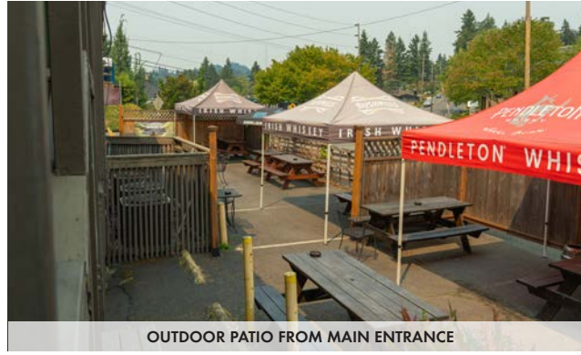
OUTDOOR PATIO FROM MAIN ENTRANCE