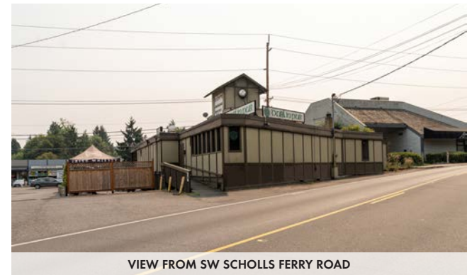
VIEW FROM SW SCHOLLS FERRY ROAD