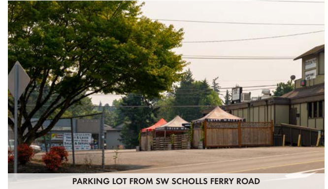
PARKING LOT FROM SW SCHOLLS FERRY ROAD