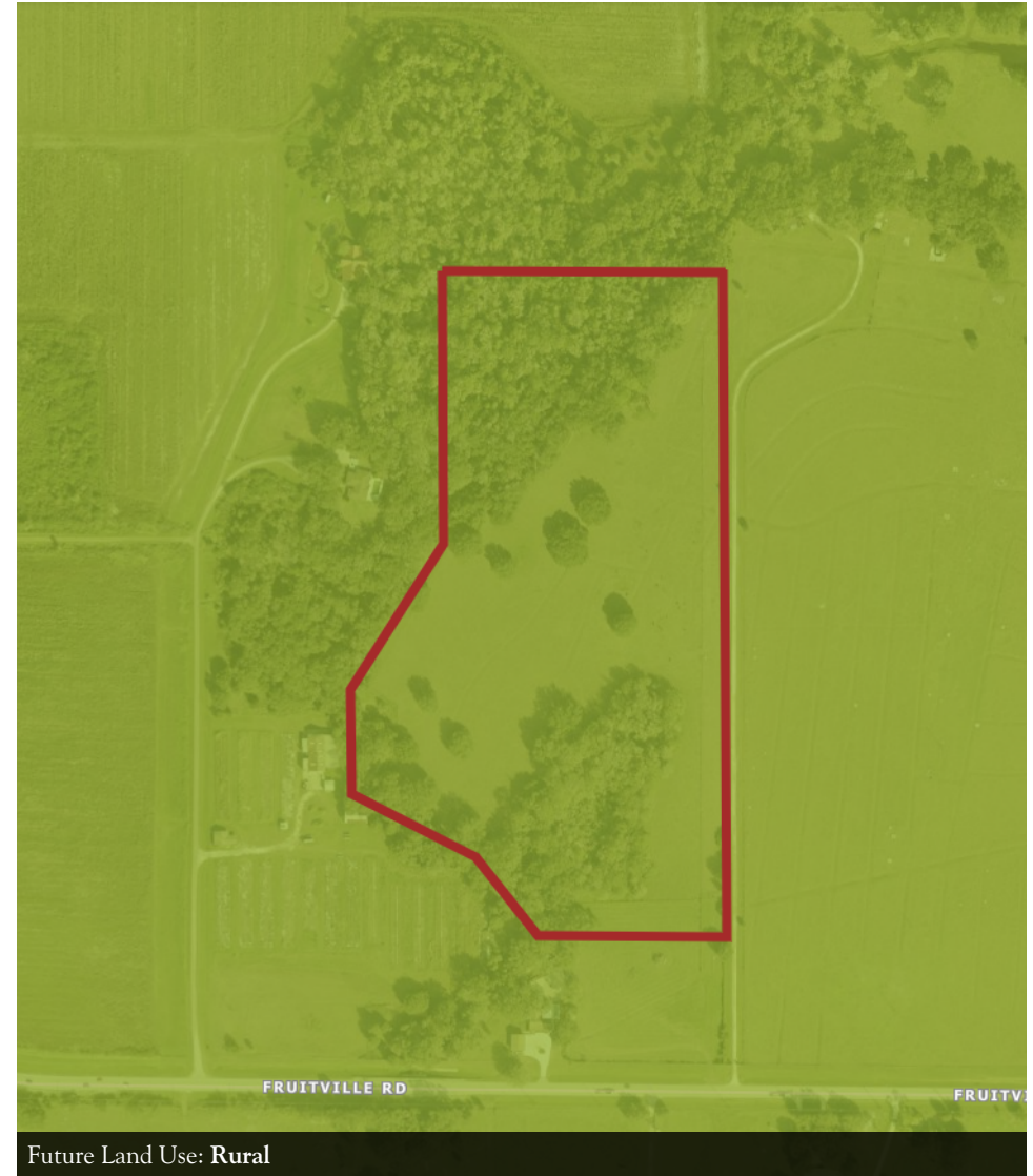
Future Land Use: Rural