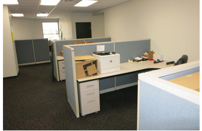
Open Office Space