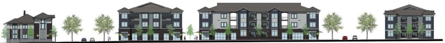
ELEVATION ALONG NE HALSEY STREET

For more information or a property tour, please contact: