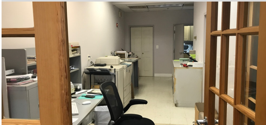
Right Bottom Image: Kitchenette in back right corner