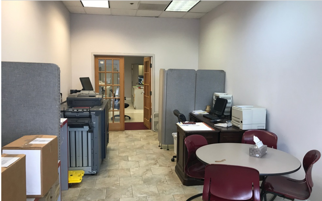
Left Image: Front Area of the Retail Condo