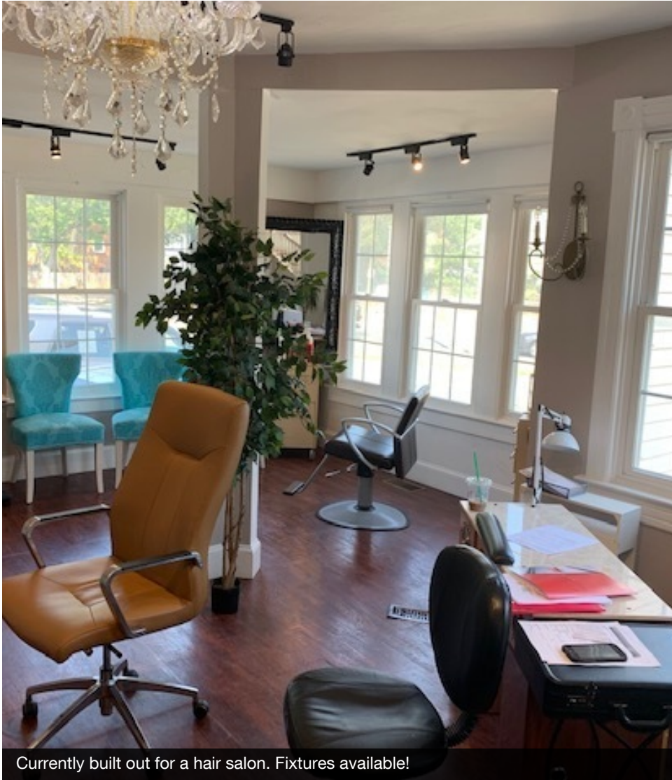
Currently built out for a hair salon. Fixtures available!