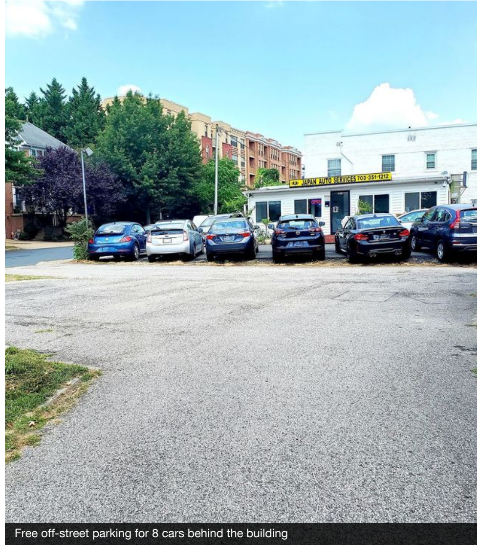
Free off-street parking for 8 cars behind the building