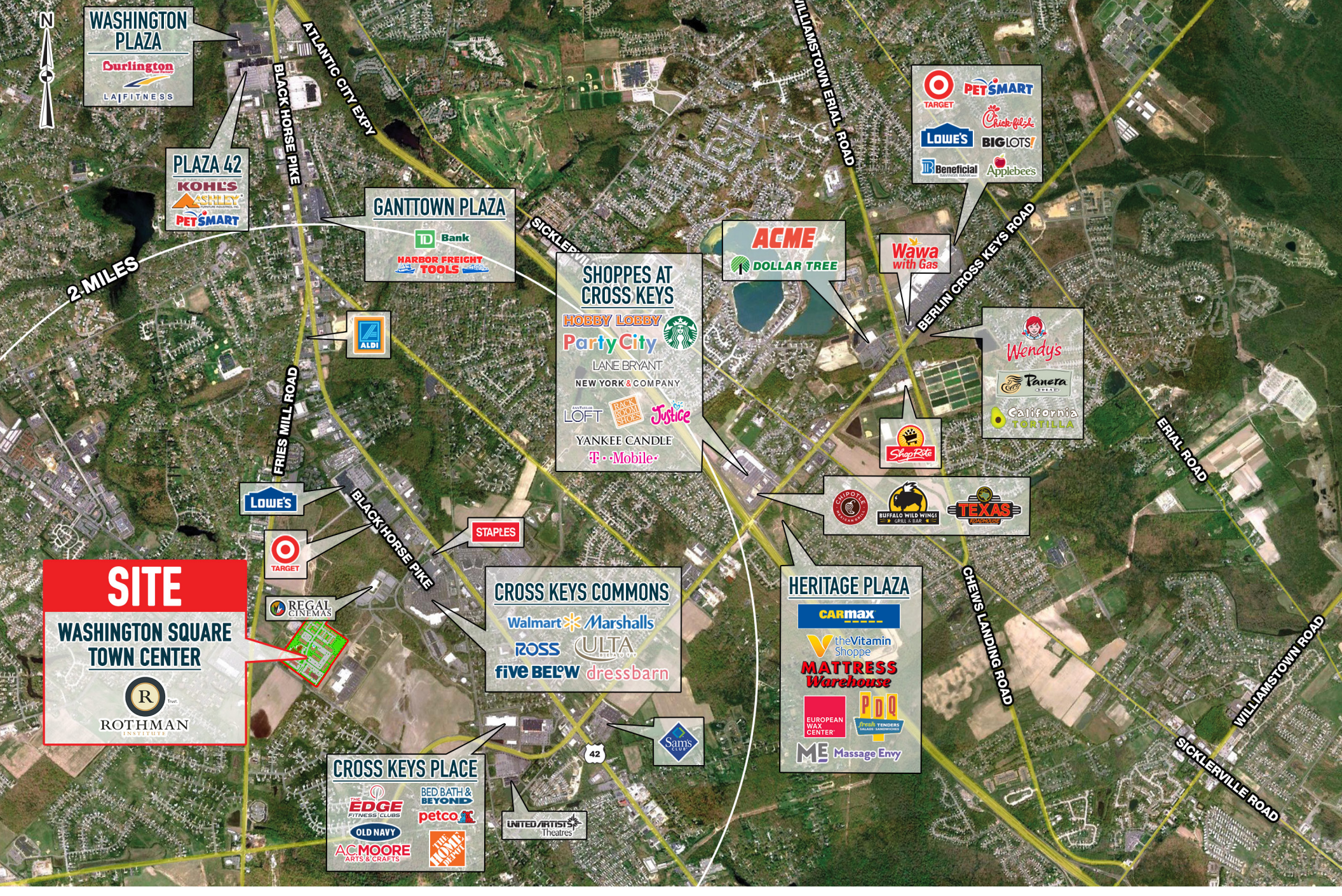
The information and images contained herein are from sources deemed reliable. However, Metro Commercial Real Estate, inc. makes no representation whatsoever as to their accuracy or authenticity. Images shown may be modified for illustrative purposes. Images may be out-of-date and not current. 10.25.1