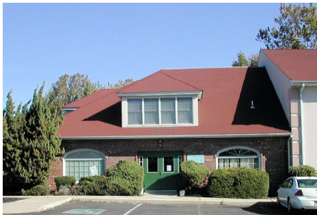
Building 1 - 3,262 SF