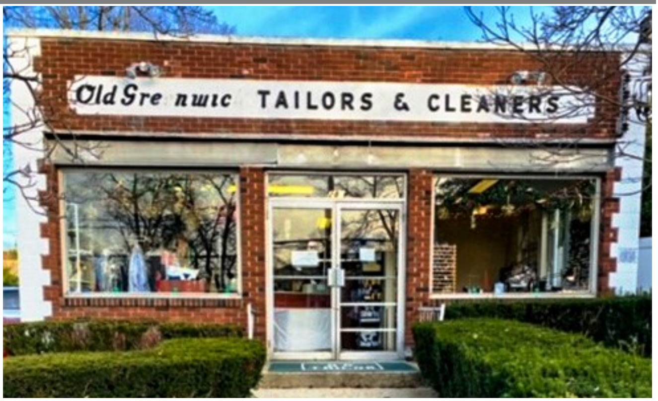
Saugatuck Commercial has been exclusively retained to offer for sale 3,387 +/- square foot retail and residential buildings constructed on 0.22 acres