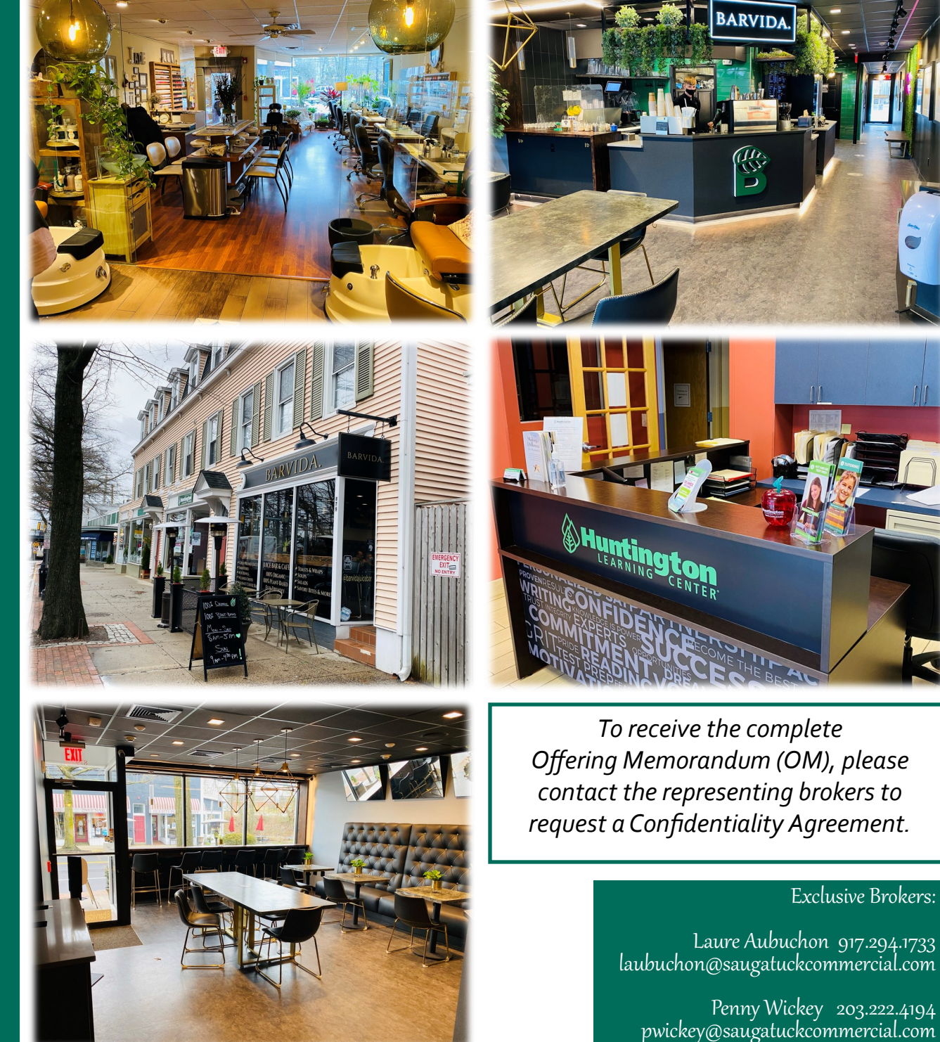
The foregoing information was furnished to us by sources which we deem reliable, but no warranty or representation is made as to the accuracy thereof. Subject to correction of errors, omissions, change of price, prior sale or withdrawal from market without notice.