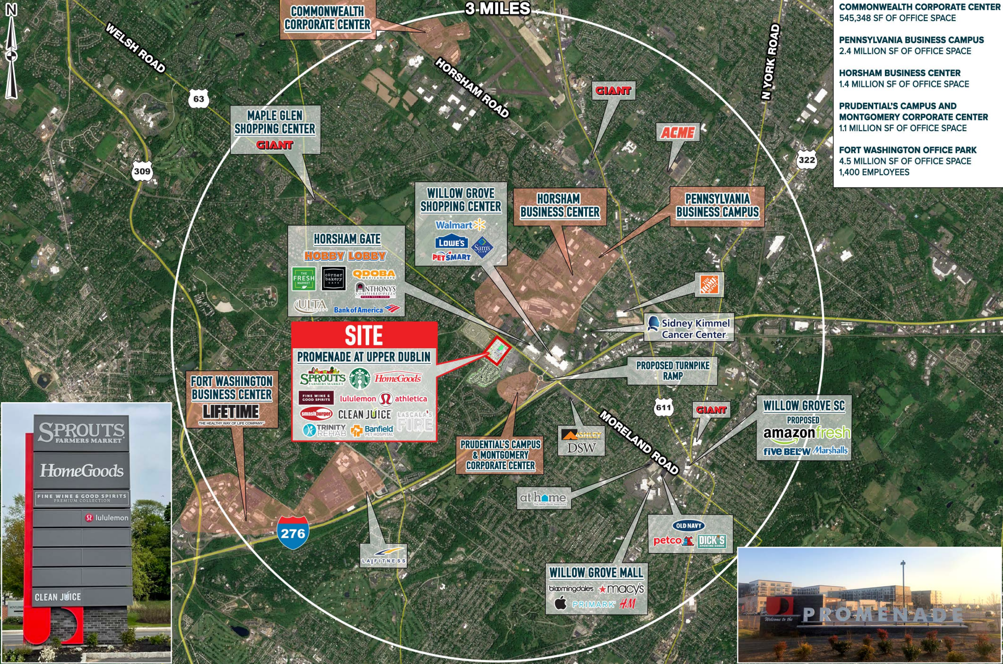
The information and images contained herein are from sources deemed reliable. However, Metro Commercial Real Estate, Inc. makes no representation whatsoever as to their accuracy or authenticity. Images shown may be modified for illustrative purposes. Images may be out-of-date and not current. 4.29.21