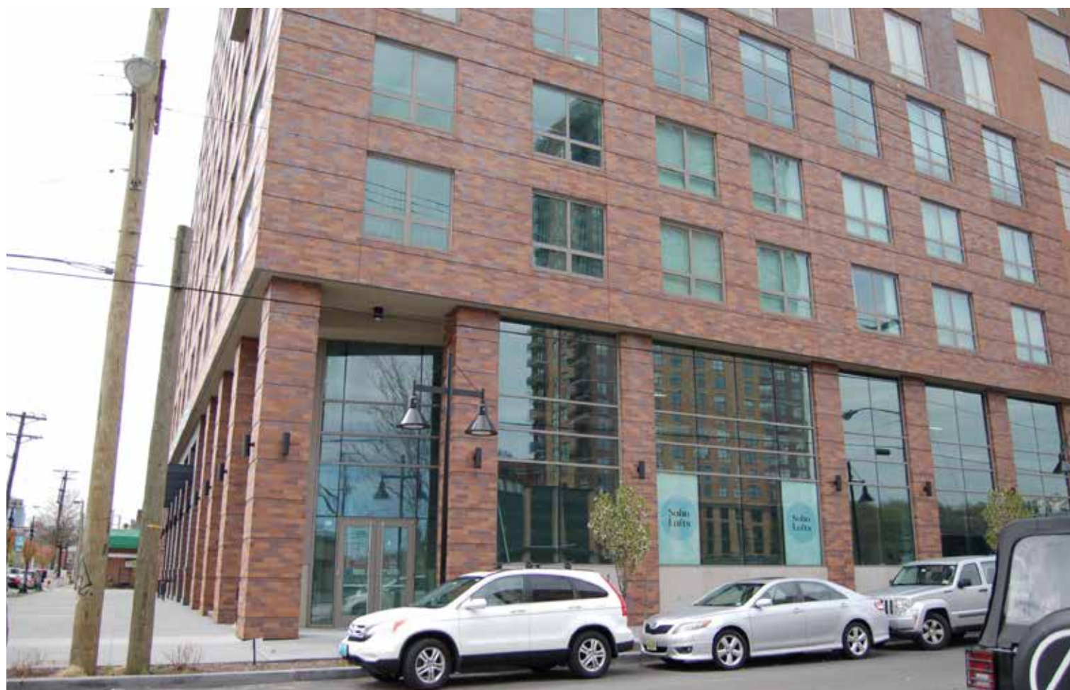
SOHO LOFTS JERSEY CITY, NJ