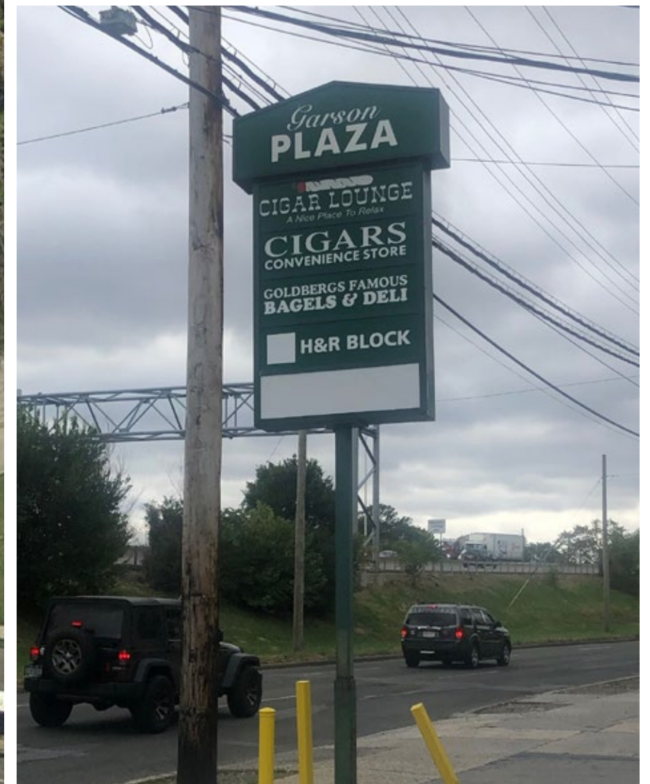
777 CENTRAL PARK AVENUE YONKERS, NEW YORK