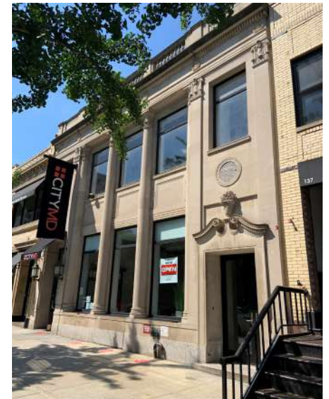
135 Montague Street (Second Floor Only)

Annual 1,781,419 Weekday 5,590 Weekend 6,562