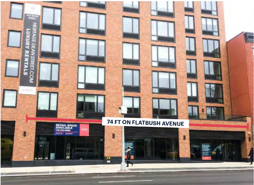
FRONTAGE ON FLATBUSH AVENUE