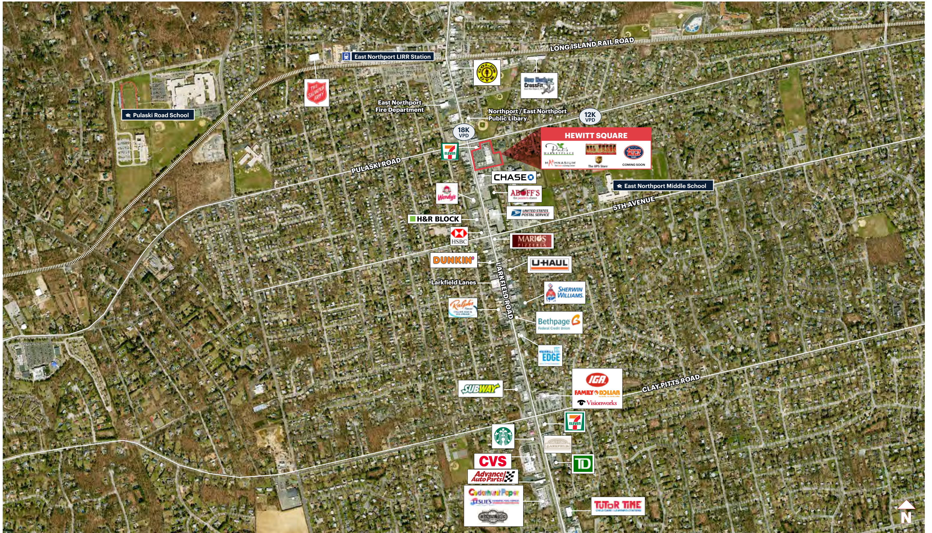
HEWITT SQUARE EAST NORTHPORT, NEW YORK