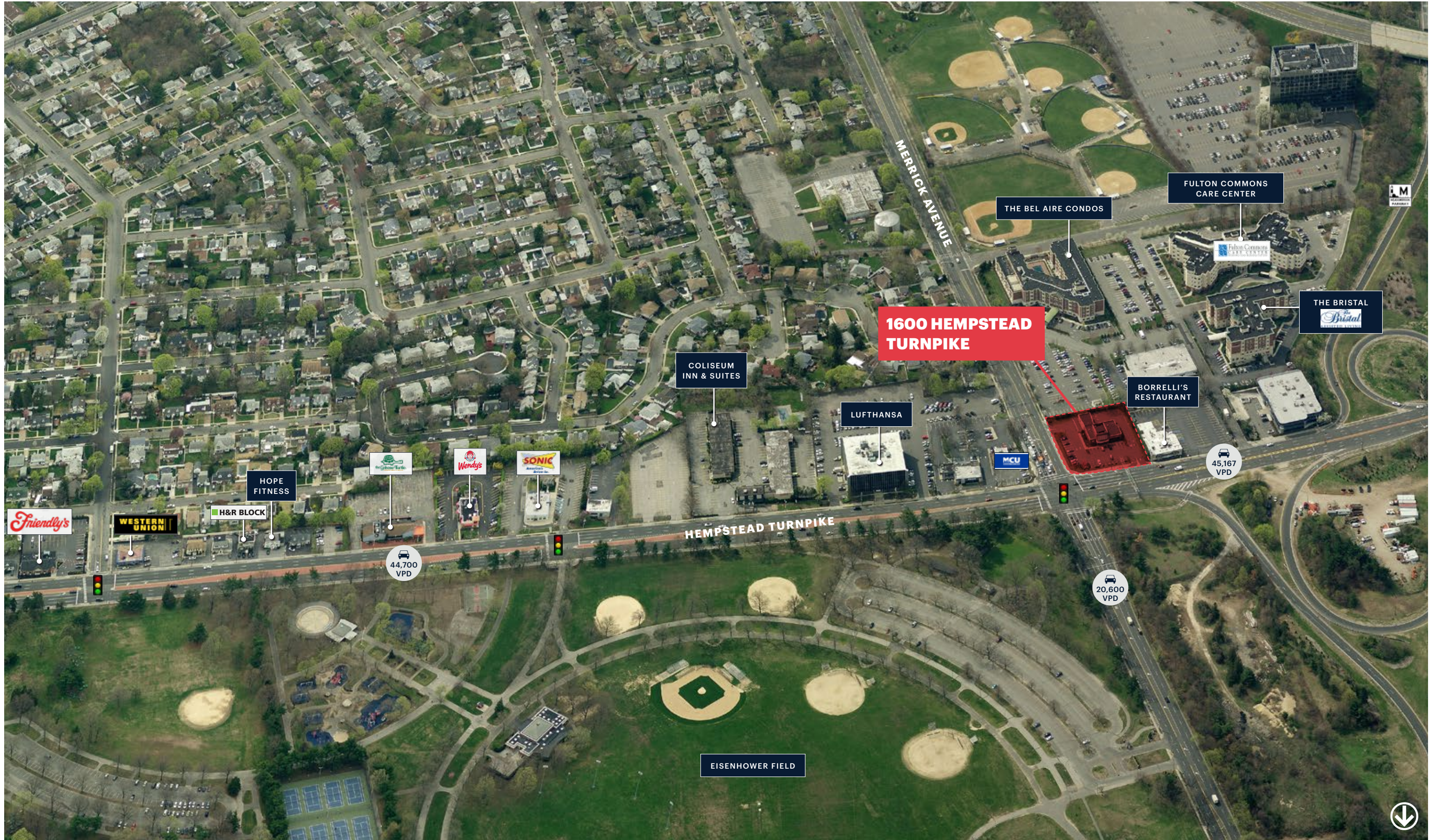
1600 HEMPSTEAD TURNPIKE EAST MEADOW, NEW YORK