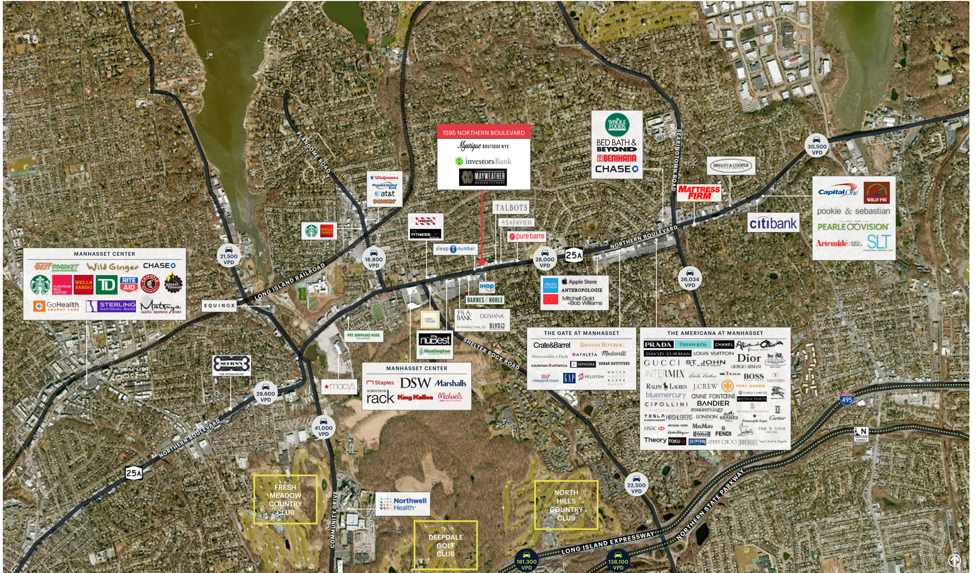
1595 NORTHERN BOULEVARD MANHASSET, NEW YORK