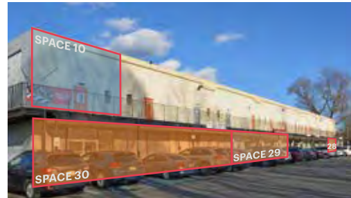
BACK LOWER LEVEL