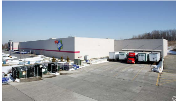
Amazon has leased a former Sam's Club in Mount Olive, New Jersey, that been vacant for nearly two years.

E-Commerce Giant Expects Mount Olive Delivery Station to Help Fill Growing Online Orders Next Year