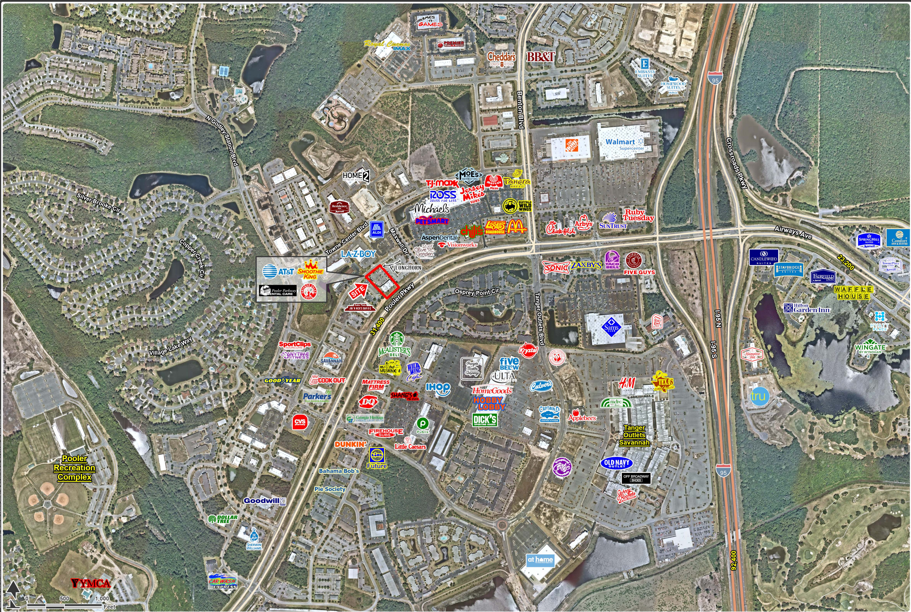
Pooler Pooler Retail Center | 155 Traders Way Pooler, GA 31322