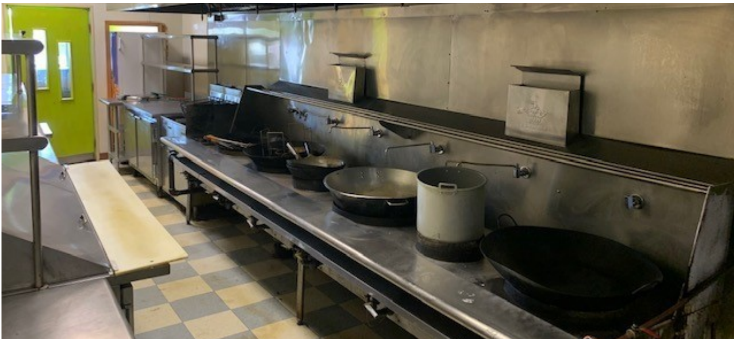
Unit 143 - 2nd Generation Restaurant