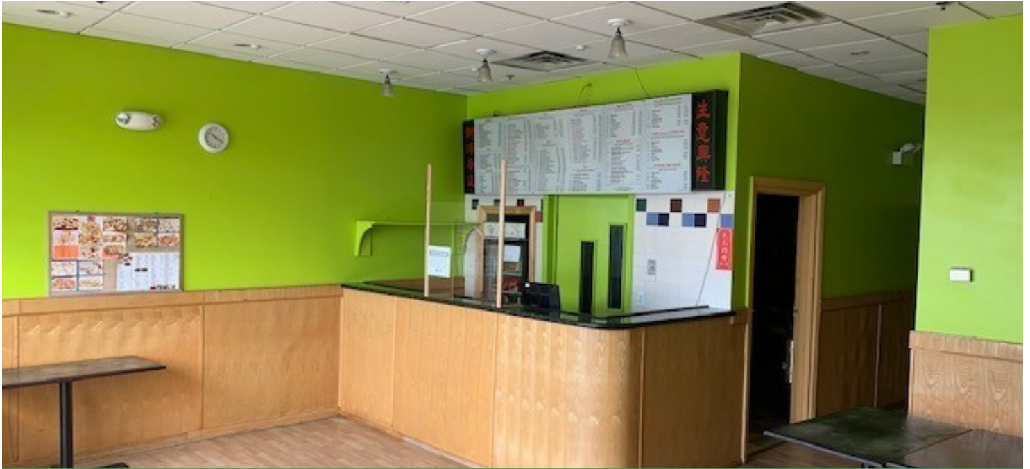
Unit 143 - 2nd Generation Restaurant