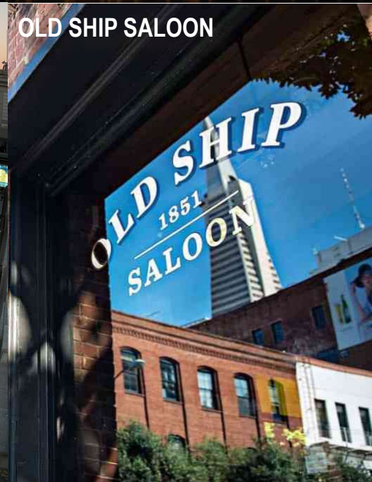
OLD SHIP SALOON