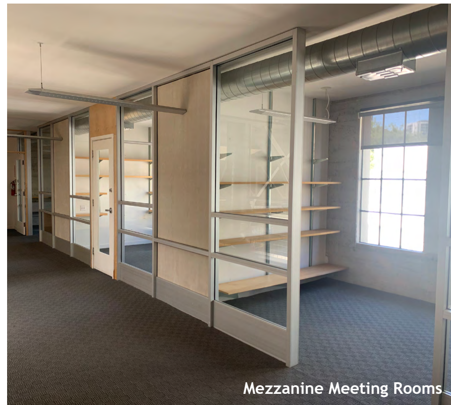
Mezzanine Meeting Rooms