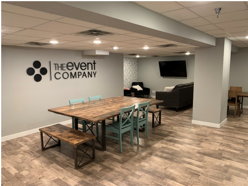
2,710 Sq Ft @ $19.00/ Sq Ft Gross