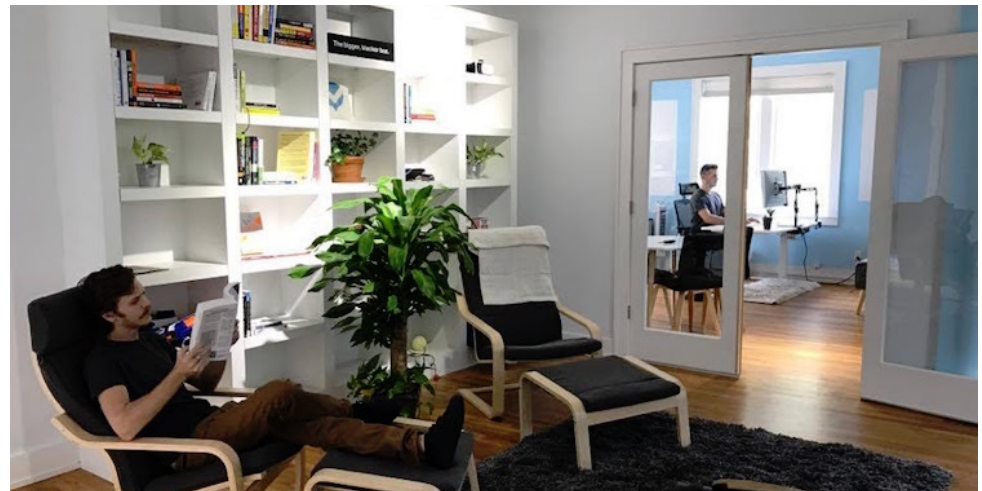
Call booths for privacy

KW COMMERCIAL 360 Central Avenue #600 St. Petersburg, FL 33701