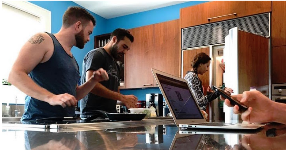
Full kitchen including washer/dryer, oven and range, and extra large subzero refrigerator