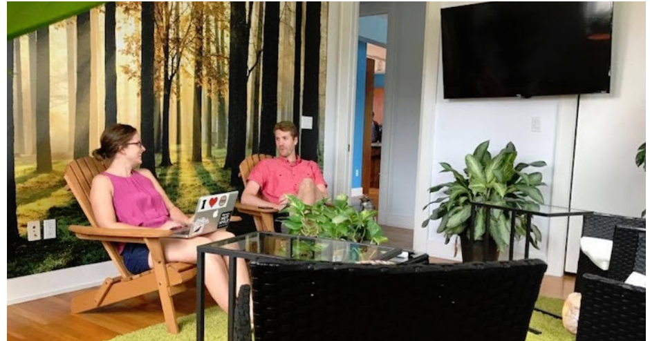
Large office / meeting room