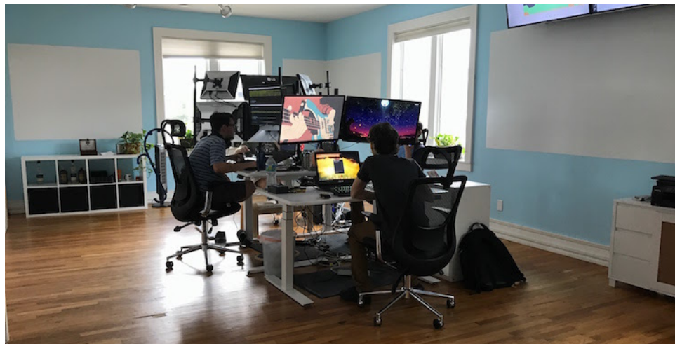
2nd floor workstation pod