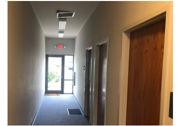
SUITE F 1,408 SF