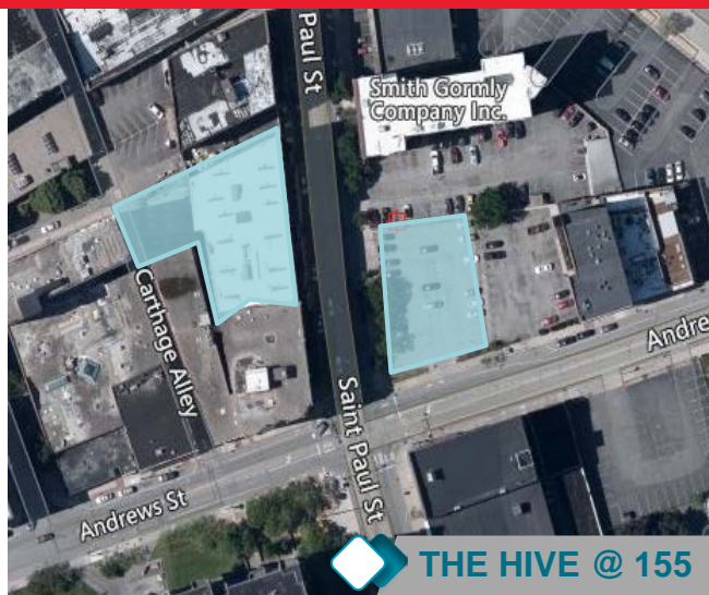
THE HIVE @ 155