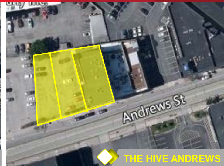
THE HIVE ANDREWS