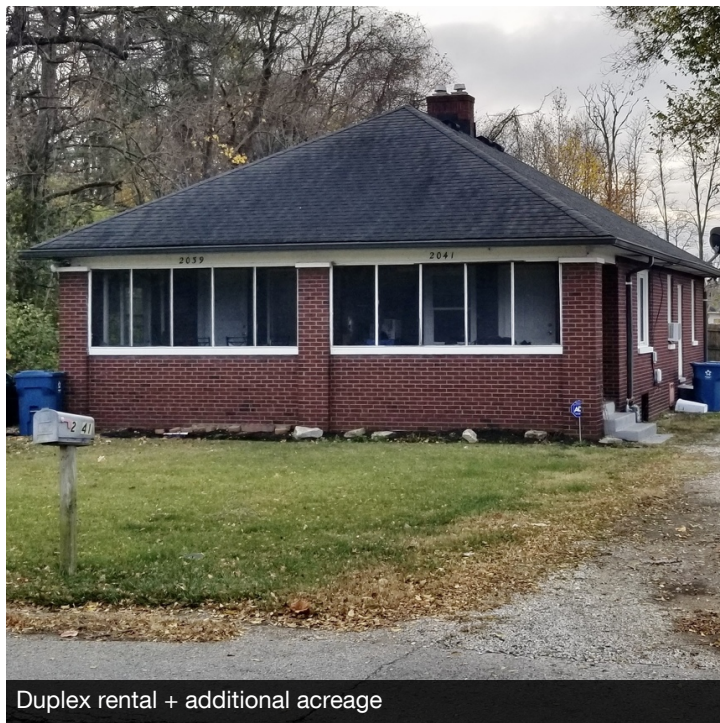
Duplex rental + additional acreage