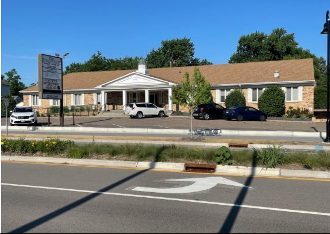
Front of building: pylon signage