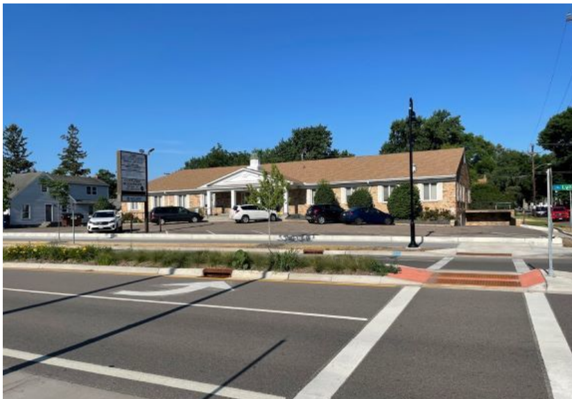
Located at the intersection of Lyndale Ave and W. 74th Street