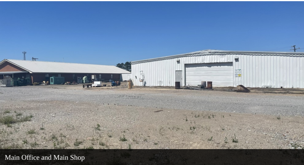
Main Office and Main Shop