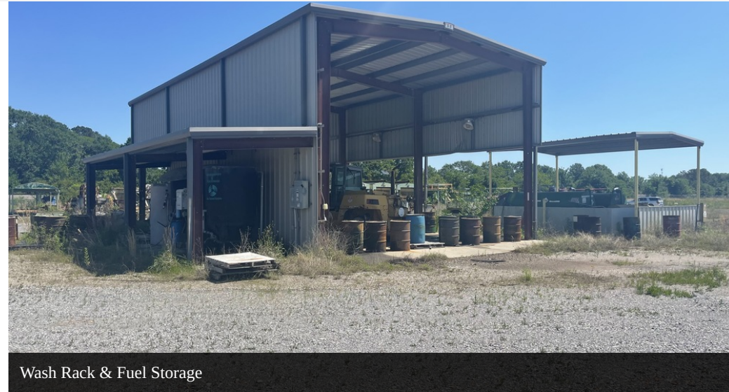
Wash Rack & Fuel Storage