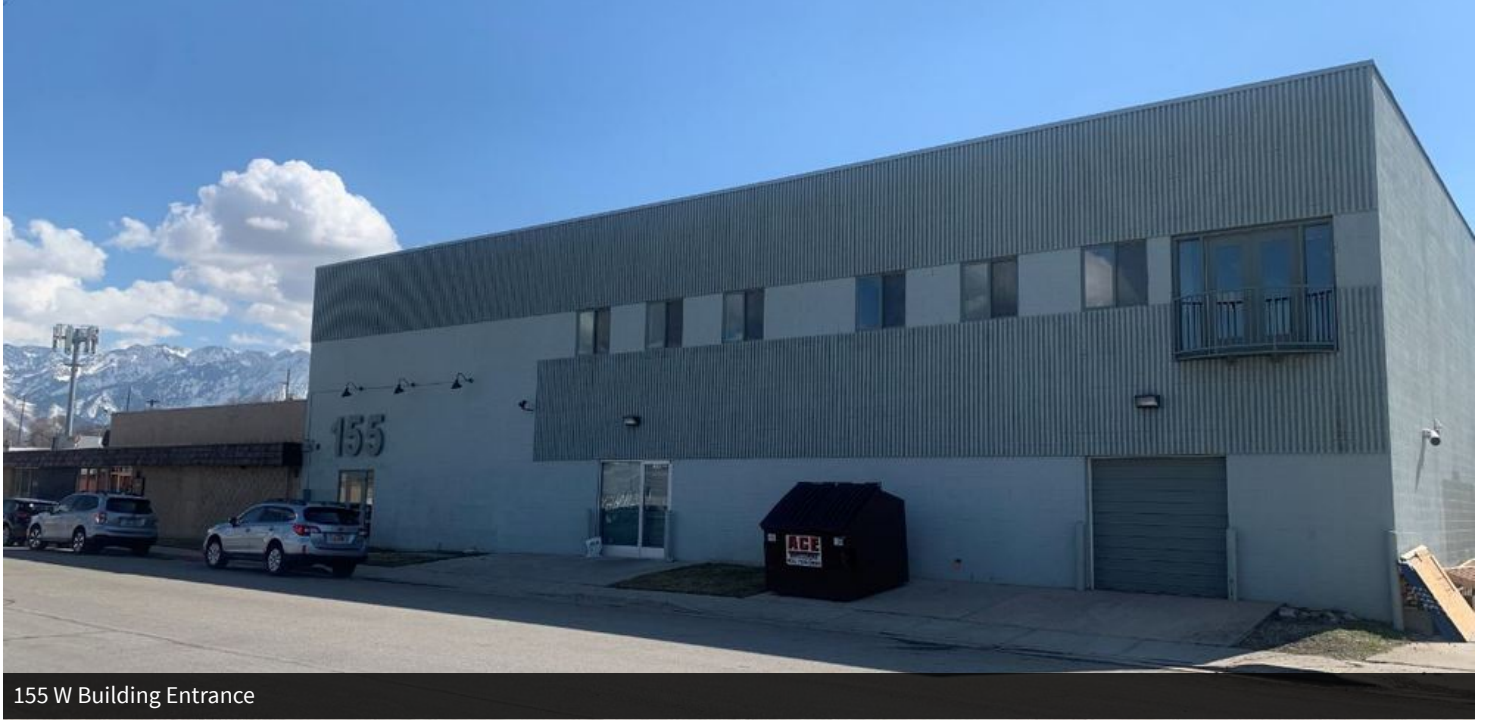
155 W Building Entrance