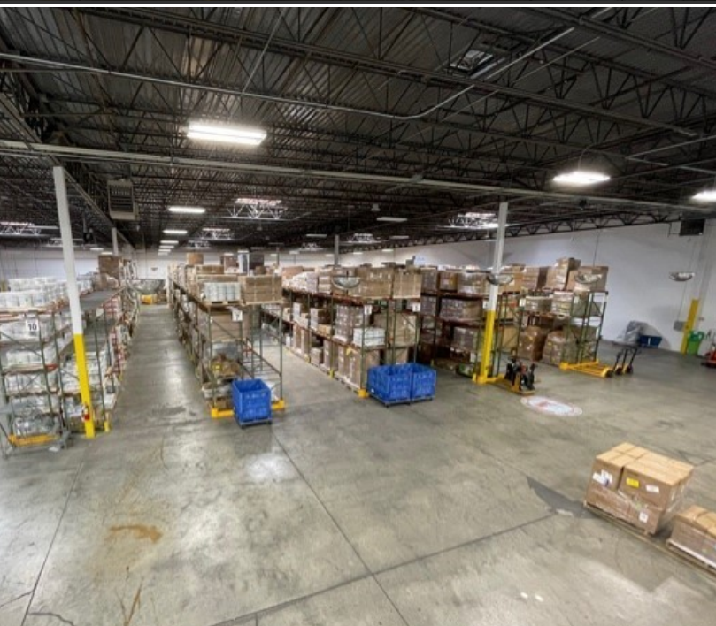
RACKING CAN BE MADE AVAILABLE