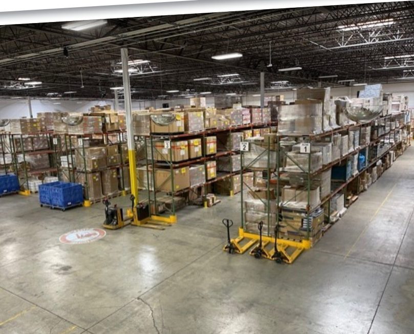
RACKING CAN BE MADE AVAILABLE