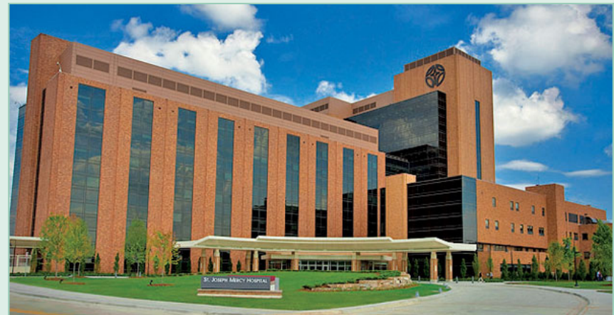
St. Joseph Mercy Hospital – Ypsilanti, MI