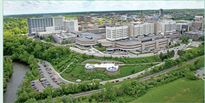
University of Michigan Health System

Trinity Health is a national, not-for-profit Catholic health system operating 93 hospitals in 22 states, including 120 continuing care locations – including home care, hospice, PACE and senior living facilities. Headquartered in Livonia, Michigan, Trinity Health employs more than 120,000 people including 5,300 physicians. Trinity Health employs over 6,800 workers in the metro Detroit/Ann Arbor area.