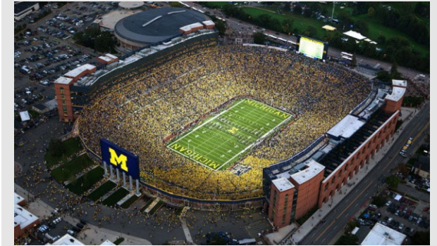
Michigan Stadium at the University of Michigan

With over 13,000 students, Washtenaw Community College (WCC) offers approximately 100 credit programs in business, health, math, natural sciences, and technology. WCC's core campus includes 14 instructional and auxiliary buildings and is surrounded by 291 acres of pristine woodlands and naturalized spaces in the heart of Washtenaw County and southeast Michigan. Adults 18-24 years of age represent almost 48% of the WCC student body and the college has an annual operating budget in excess of $98.5M. WCC charters Washtenaw Technical Middle College, one of the most successful high school middle colleges in the country.