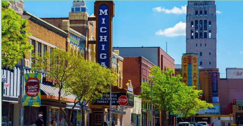
Downtown Ann Arbor