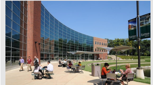
Eastern Michigan University