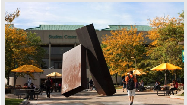
Washtenaw Community College