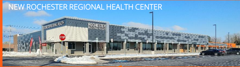
NEW ROCHESTER REGIONAL HEALTH CENTER