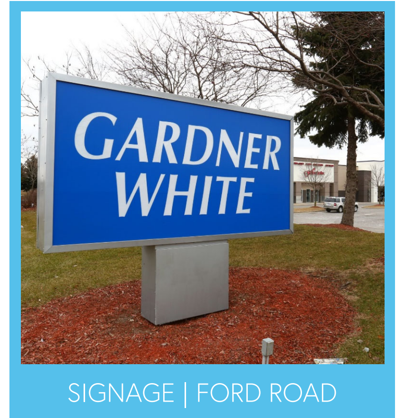
SIGNAGE | FORD ROAD